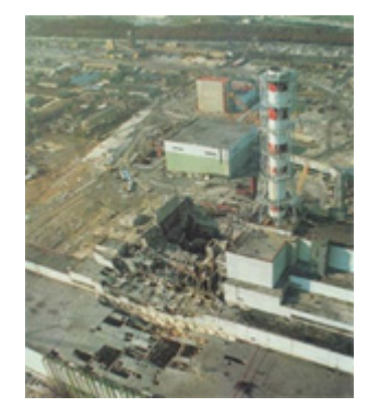
Chernobyl: Crucible of the Culture Concept

"The accident can be said to have flowed from deficient safety culture, not only at the Chernobyl